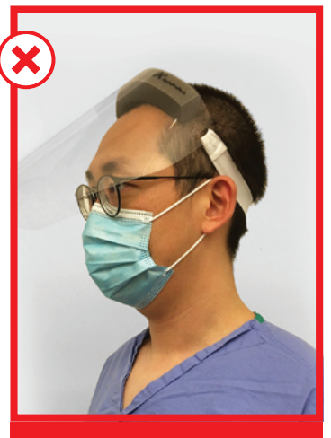
Do not have the face shield extend away from your face.