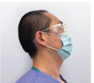
2. Safety glasses should cover your mid-temple to your nose.