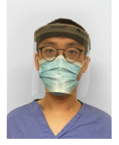
1. Face shield should extend below your chin.