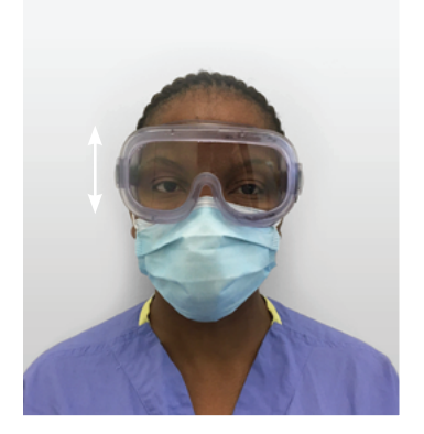
1. Goggles need to cover from your eyebrow to at least your cheekbone.