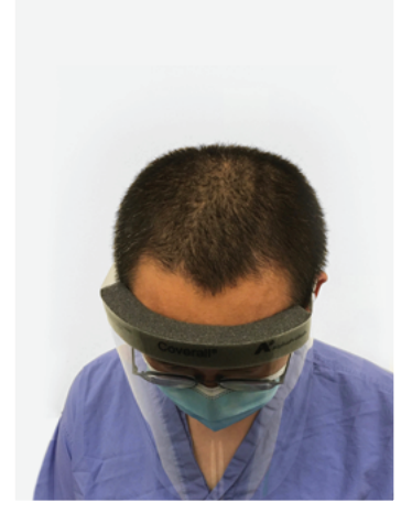
3. Face shield should be worn directly across your forehead.

2. Ensure there are minimal gaps between the edges of the eye protection and your face.