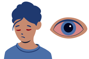
Sore red eyes

If you have been exposed to measles or another communicable disease, please inform a health care provider.